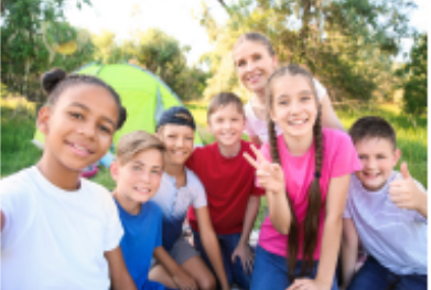
REGISTRATION STARTS APRIL 27TH

Ist - 6th Grade July 15 - 19, 9:00AM - 3:00PM Bring lunch, Snacks provided